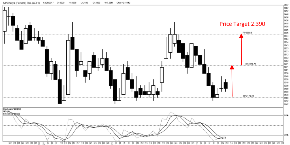
Kinerja saham ADHI

Danareksa research report are also available at Reuters Multex and First Call Direct and Bloomberg